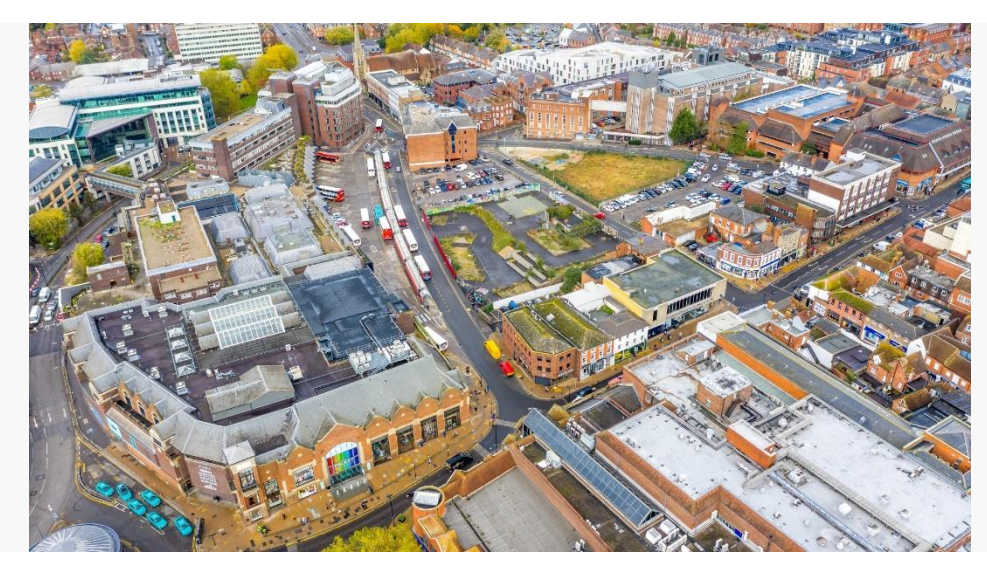
Aerial view of the North Street Regeneration site.

The £166 million Friary Quarter for 473 homes and commercial and retail units has three public squares and spaces, new water features and public art with planting 120 trees.