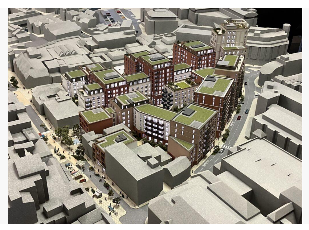
The model viewed from a south-east aspect with North Street market represented bottom left.

The spokesperson confirmed the developer's commitment to public access through the developed site saying: "The paths and spaces within the development will be privately owned (as is common), however will remain publicly accessible.