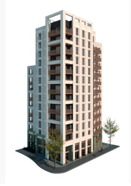
The highest building visually appears to be 15 storeys high with 14 occupied floors topped with an enclosed plant room.

"Many of these routes provide access to the commercial spaces being delivered across the site for use by the public. It would not be practical to close off these routes in the future, nor would it be acceptable to Guildford's planners or in line with St Edwards' vision for the regeneration – to create a place that the whole community can visit and enjoy."