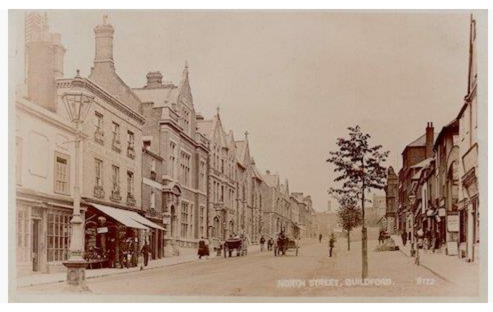
A picture postcard view of North Street in the 1900s.

But elsewhere there is no danger of Guildford being stuck in the past. The public areas away from the High Street are very modern.