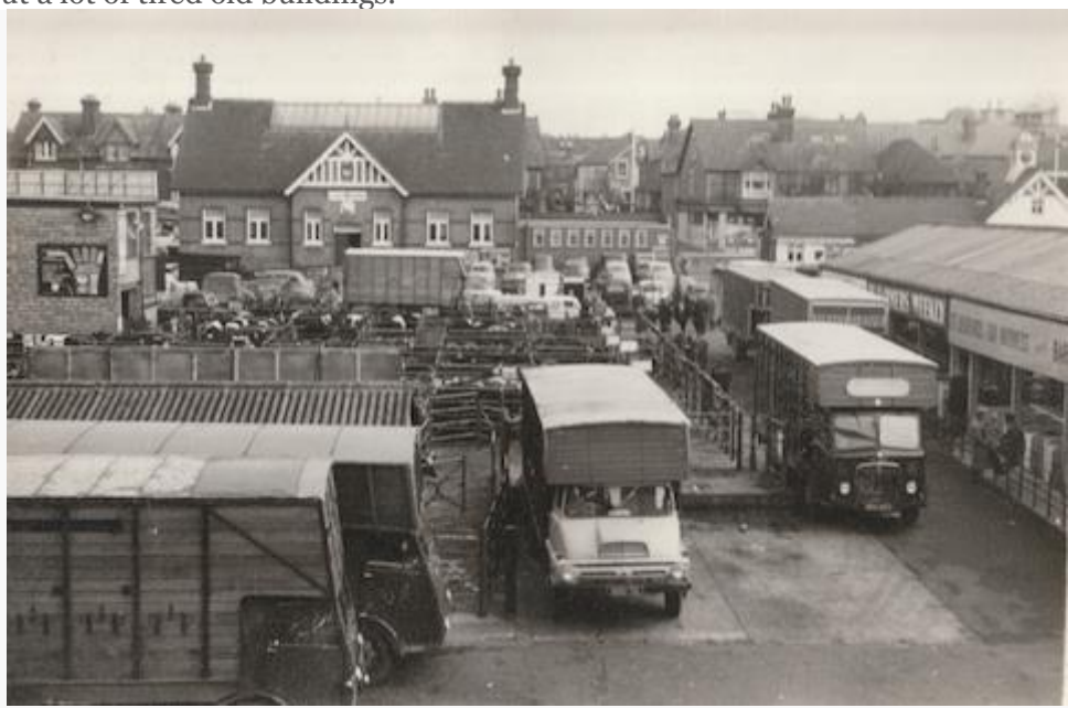
Guildford cattle market.

We can't keep everything nor should we. Indeed, a lot of the old buildings in the town were beyond repair as <u>David Rose pointed out previously in an excellent article</u>. Guildford has certainly weeded out a lot of tired old buildings.