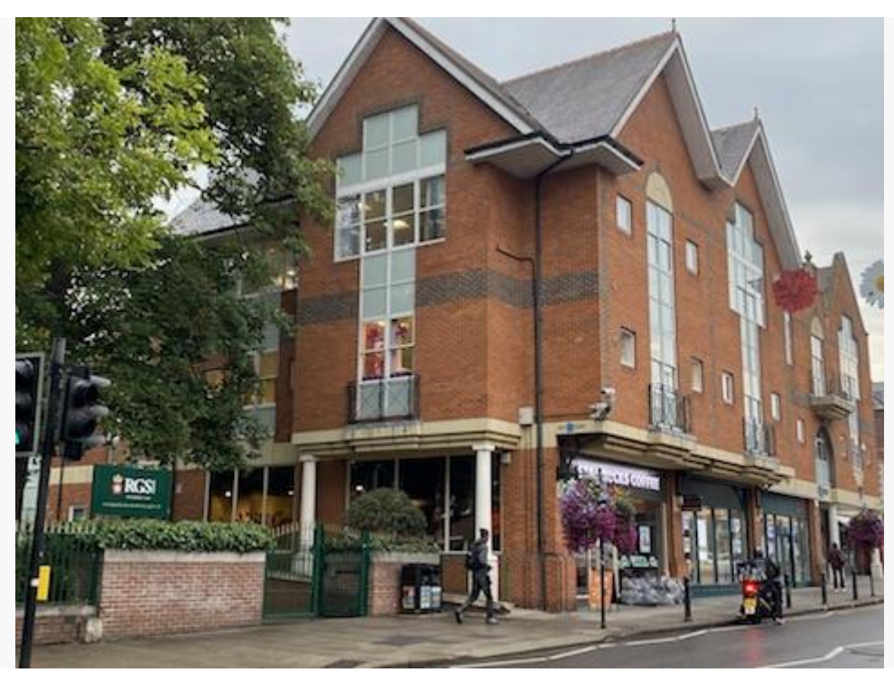
More modern buildings in an attempt by the council in the 1980s to force developers to build in sympathy with the town's unique character.

The Friary shopping centre has done the economy proud but developers promised the town a public square with lighting and fountains. What we got was an atrium with an escalator that the BBC used as a futuristic prison in the popular 1980s sci-fi series Blakes 7 .