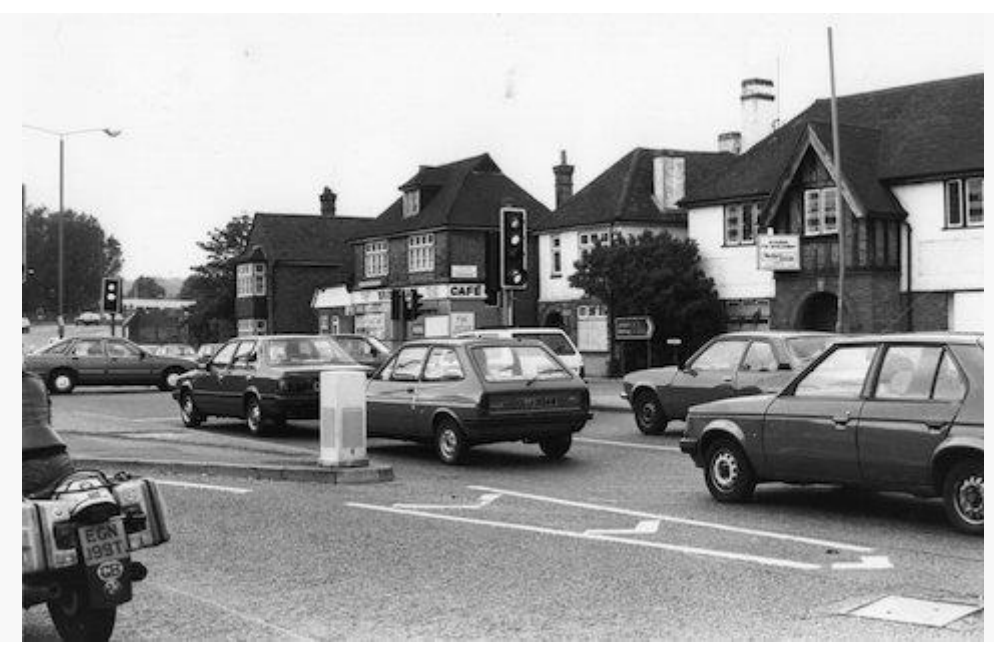
The Ladymead cafe and houses where the retail park is today.

Ladymead, an entire development between the wars, has nothing original left.