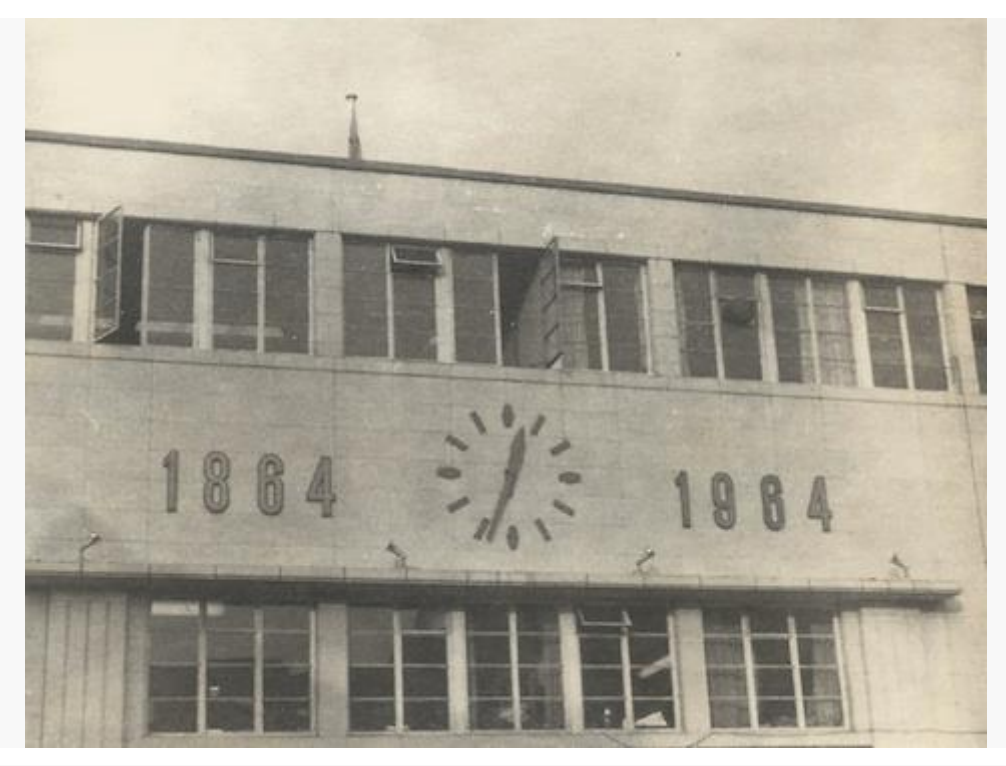
The Surrey Advertiser building in Martyr Road pictured at the time of the newspaper's centenary. The Art Deco offices and print works opened in 1937.