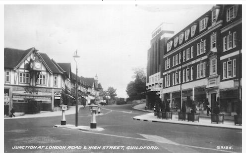
The Odeon cinema in Epsom Road.

There is also nothing left to recall the iconic styles of the 1930s. The frontages of the Surrey Advertiser offices and the Odeon cinema could have made fine contributions to the townscape but both have gone.