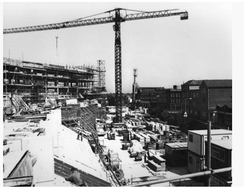
The Friary centre under construction.

The gyratory system cut the High Street off from the river. The Bedford Road car park area is not people friendly.